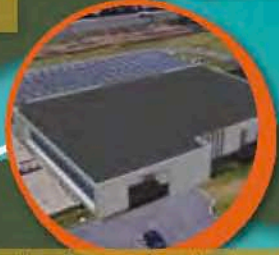
Water Treatment Plant Upgrades