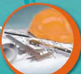
Wastewater Treatment Plant Construction