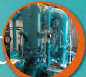
Booster Station Improvements