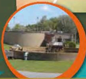
Wastewater Treatment Plant Contract Operations