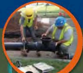
Water Main Replacement