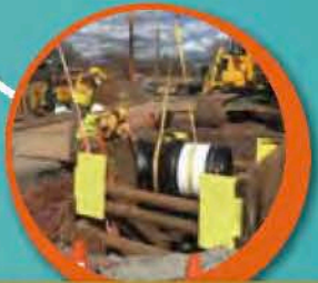
Secondary Transmission Main Construction